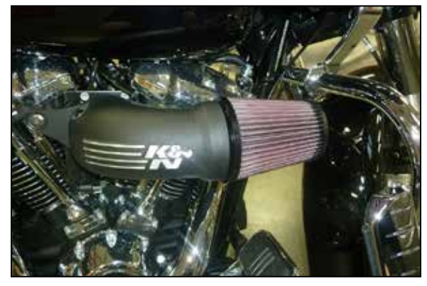
12. Install the K&N<sup>®</sup> air filter onto the intake tube and secure with the provided hose clamp.

NOTE: Apply one drop of the provided thread locker onto the studs.