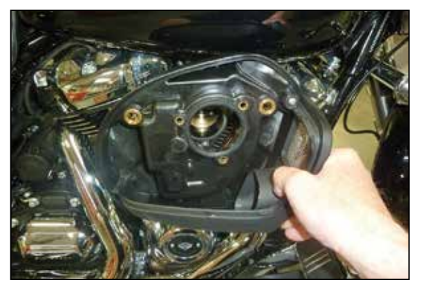
5. Remove the two breather/air filter base mounting bolts as shown.

6. Remove the air filter base from the vehicle as shown.