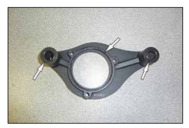
7. Install three of the o rings provided onto the back side of the K&N<sup>®</sup> back plate as shown. A small amount of grease maybe used to hold the o rings in place.