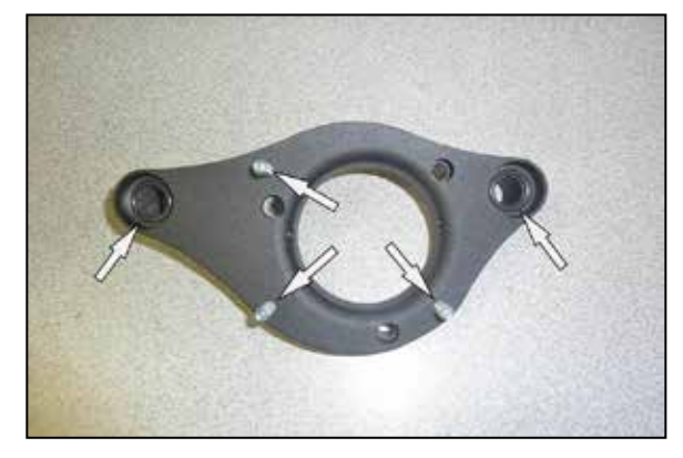
8. Install the remaining two o rings onto the front of the back plate as shown. Install the three provided studs with thread locker positioned into the back plate.