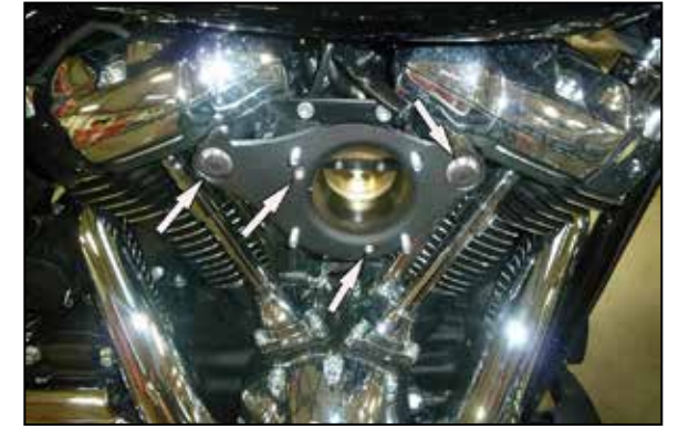
10. Using the two provided crankcase breather bolts; install the back plate onto the vehicle. Do not tighten bolts at this time. Then secure with the two other bolts provided. Tighten all bolts at this time. NOTE: Apply one drop of the provided thread locker onto the bolts.